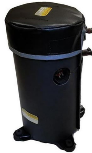
Scroll Compressor - Body Wrap & Rain Shield Cap

For easy identification and location, a stainless steel or aluminum name plate tag is riveted to each blanket piece. 1/8" (0.32CM) embossed lettering shows location, description, size, pressure rating and tag number sequence. Each blanket will include an I.D. Plate.