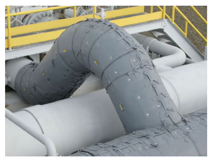
24" IPS Outdoor Service Piping – 12 dBA Reduction

Blanket Insulation Weight: When designing blanket insulation where a multi-piece construction is necessary, the total number of pieces will be minimized. Any one piece will not exceed 40lbs (18 KG) in weight.