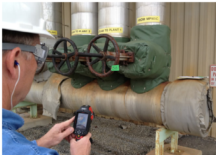
Outdoor Steam Header Gate Valves

Leak Accommodations: To accommodate a leak and detect its origin, blankets will have a low point stainless steel or brass drain grommet or the design will incorporate a mating closure seam at the lowest point of the blanket.