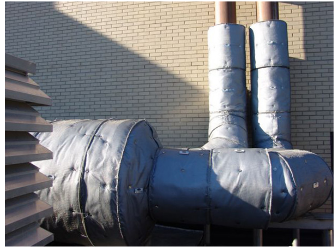
Engine Exhaust Silencer

Leak Accommodations: To accommodate a leak and detect its origin, blankets will have a low point stainless steel drain grommet or the design will incorporate a mating seam at the lowest point of the blanket.