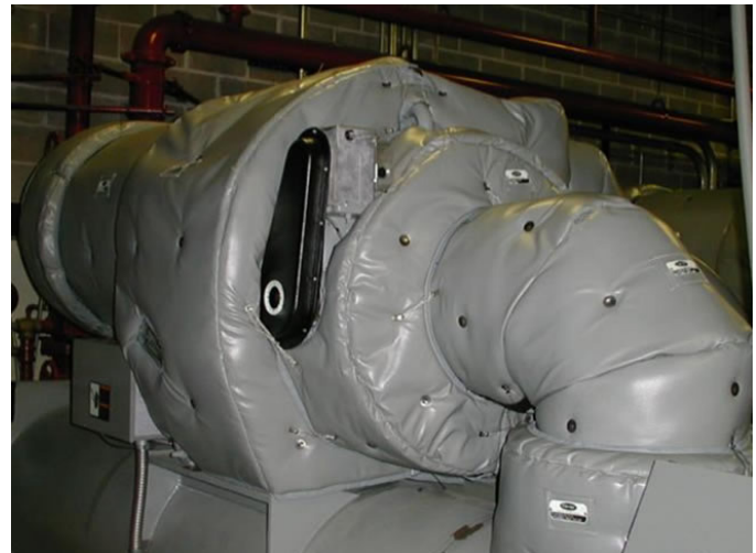
Centrifugal Liquid Chiller – 6-8 dBA Reduction

Blanket Overlap: To minimize heat loss, the blanket will extend beyond mating flanges unto existing insulation for a minimum of 2" (5 CM). Where blanket cannot fit over existing oversized insulation, blanket will butt up to existing insulation with a friction fit closing seam. All sections of pipes will be insulated and open gaps are not acceptable. Blanket diameters which are 2" (5 CM) or larger than existing insulation must be end capped to eliminate open air void.