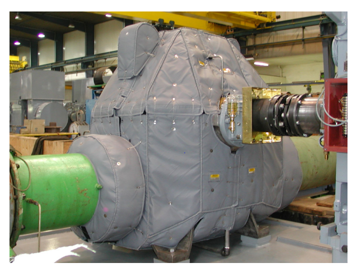
Split Case Double Suction Pump – 6 dBA Reduction

Blanket Overlap: To minimize heat loss, the blanket will extend beyond mating flanges unto existing insulation for a minimum of 2" (5 CM). Where blanket cannot fit over existing oversized insulation, blanket will butt up to existing insulation with a friction fit closing seam. All sections of pipes will be insulated and open gaps are not acceptable. Blanket diameters which are 2" (5 CM) or larger than existing insulation must be end capped to eliminate open air void.