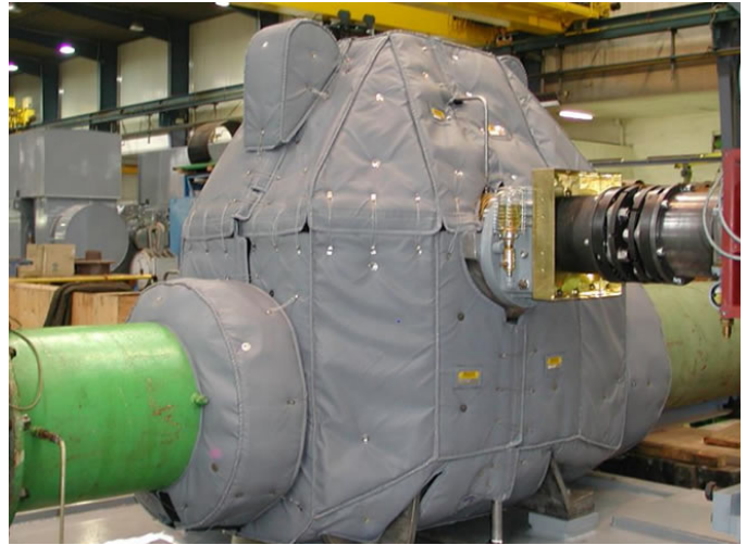
Split Case Double Suction Pump – 6 dBA Reduction

Blanket Overlap: To minimize heat loss, the blanket will extend beyond mating flanges unto existing insulation for a minimum of 2" (5 CM). Where blanket cannot fit over existing oversized insulation, blanket will butt up to existing insulation with a friction fit closing seam. All sections of pipes will be insulated and open gaps are not acceptable. Blanket diameters which are 2" (5 CM) or larger than existing insulation must be end capped to eliminate open air void.