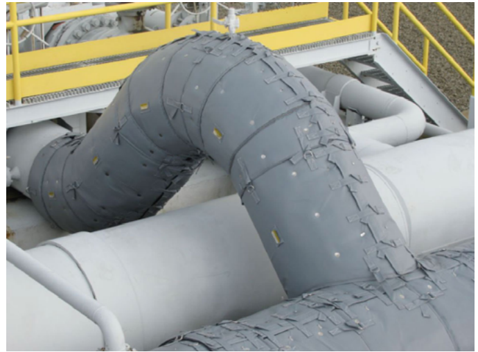
24" IPS Outdoor Service Piping – 12 dBA Reduction

Blanket Insulation Weight: When designing blanket insulation where a multi-piece construction is necessary, the total number of pieces will be minimized. Any one piece will not exceed 40lbs (18 KG) in weight.