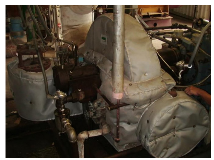
Single Wheel – Steam Turbine

Blanket Overlap: To minimize heat loss, the blanket will extend beyond mating flanges unto existing insulation for a minimum of 2" (5cm). Where blanket cannot fit over existing oversized insulation, blanket will butt up to existing insulation with a friction fit closing seam. All sections of pipes will be insulated and open gaps are not acceptable. Blanket diameters which are 2" (5cm) or larger than existing insulation must be end capped to eliminate open air void.