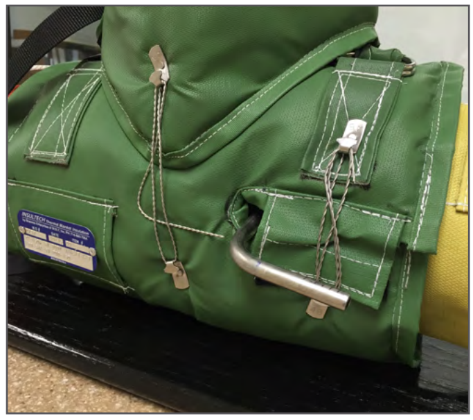
Integral Steam Heat Kit & Gate Valve Blanket