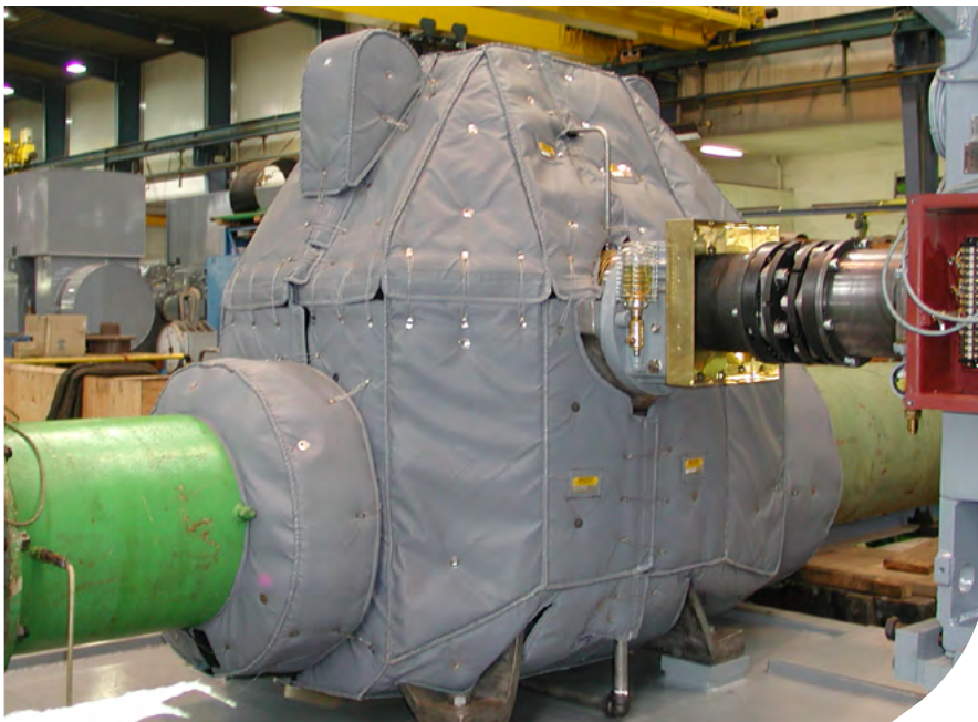
16"x18" CENTRIFUGAL PUMP Design: LT450A-TT – 1.5" thick 6.0 dBA Reduction