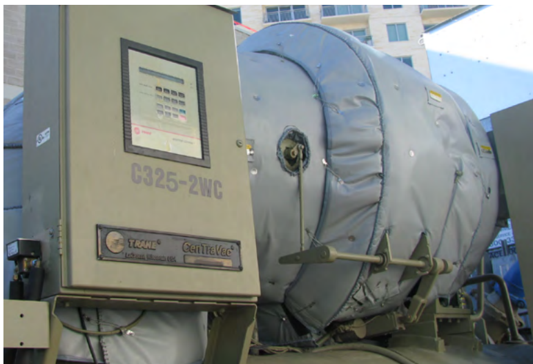
HVAC LIQUID CHILLER COMPRESSOR, COMPRESSOR INLET, MOTOR HOUSING

Engineering Reusable Solutions for a Sustainable Planet