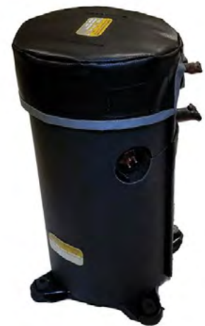
ACOUSTIC SHIELD SCROLL COMPRESSOR Design: LT250AS 6.0 dBA Reduction