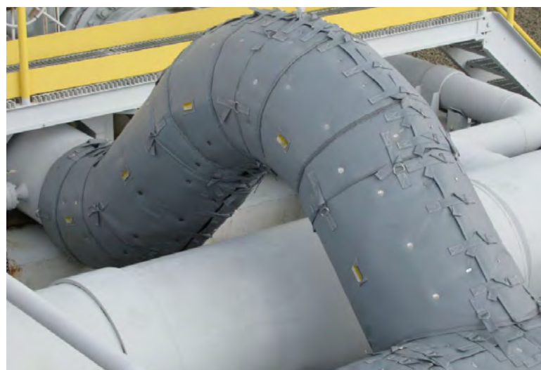
24" PROCESS PIPING